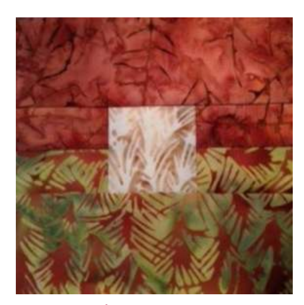
January Little Square