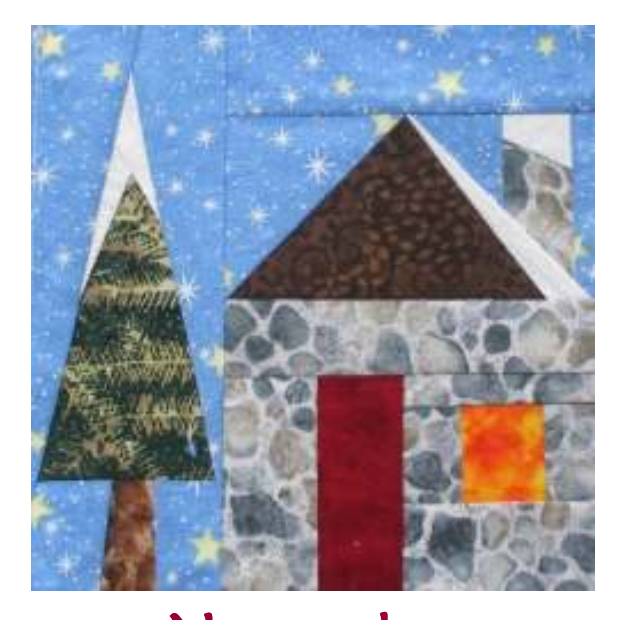
November Winter House