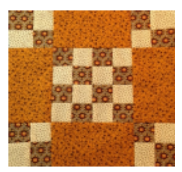
November Civil War Block

December 2015 Block of the Month – "1 of 100 Bocks"