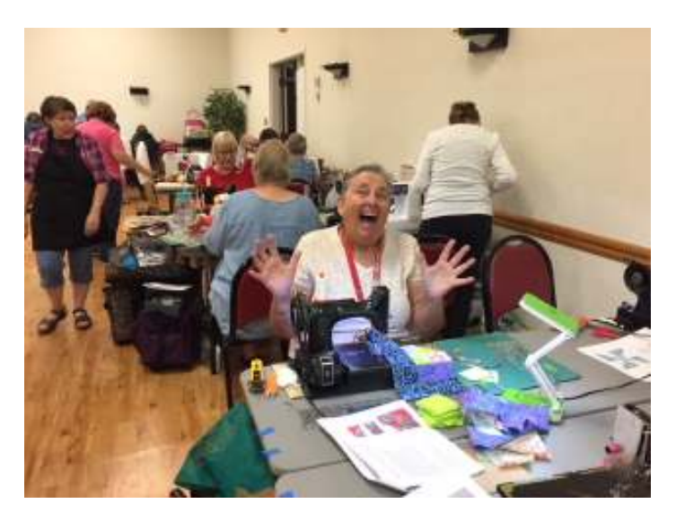
We were having FUN, FUN, FUN!!!