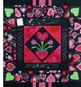
Town and Country