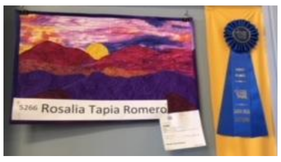
Best Use of Color & Design