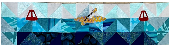
2025 Sew-a-Row Starter