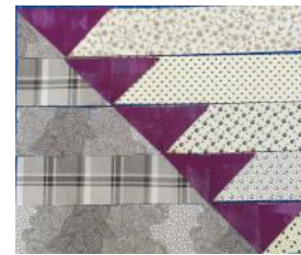
Layout for companion piece. Note: geese are pointed in a different direction.