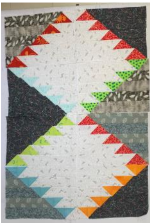
Possible layout with 8 blocks.