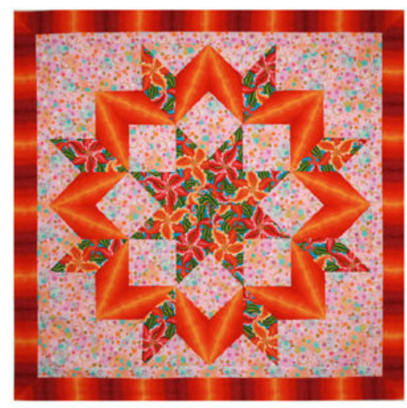
Freckled Lily by Jan Krentz

Sew this beautiful star quilt with the ease of straight piecing, and no "Y" seams! Based upon a pattern in Jan's book, Quick Star Quilts & Beyond . Select several coordinating fabrics for the diamonds, background and borders. Finished size: 58" square without borders; approximately 65-68" square with borders. This workshop is filling up very fast and we will begin taking names for a waitlist soon.