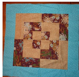
15. Golden Patchwork