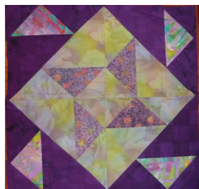
6. Friendship Star