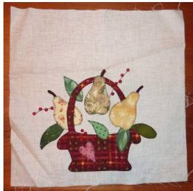
9. Pear Basket