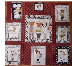
16. Too Many Cooks