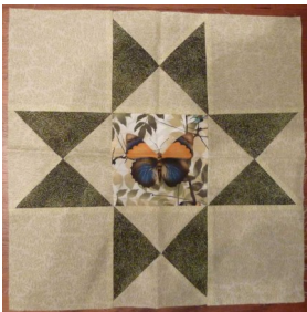
5. Butterfly from Ohio