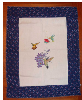
14. Happy Hummingbirds