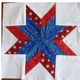
17. USA Star