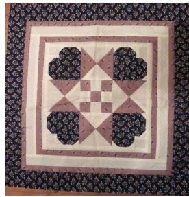
3. Ohio Star