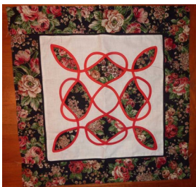
6. Meandering Ribbons