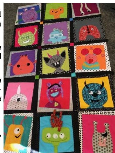
Toni's lost "Monster" Quilt

"I have let go of our old location, and looking forward to a new adventure in life."