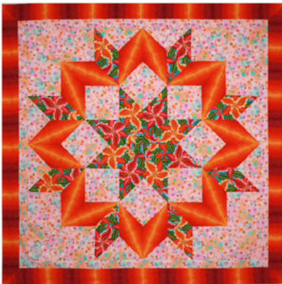
Freckled Lily by Jan Krentz

Sew this beautiful star quilt with the ease of straight piecing, and no "Y" seams! Based upon a pattern in Jan's book, Quick Star Quilts & Beyond . Select several coordinating fabrics for the diamonds, background and borders. Finished size: 58" square without borders; approximately 65-68" square with borders. This workshop is filling up very fast and we will begin taking names for a waitlist soon.