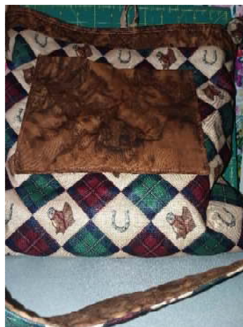
Voila! The finished bag!

Making the strap: Right sides together, pair with batting, sew, turn right side out, top stitch. Place the strap at the side seams. Sandwich the strap between the outer bag and the lining (right sides together). Top stitch closed. Don't forget to stitch up the lining.